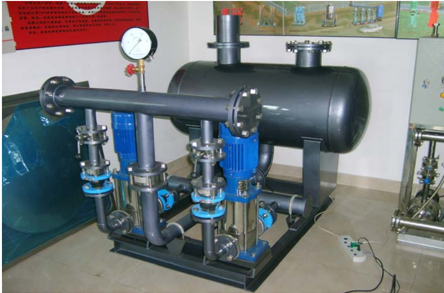
Full Automatic Constant Pressure Water Supply System