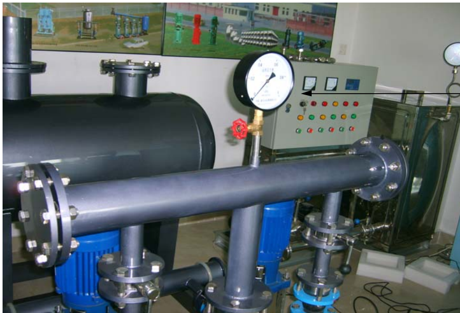
Feedback pressure gauge